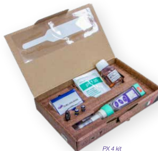
PX 4 kit